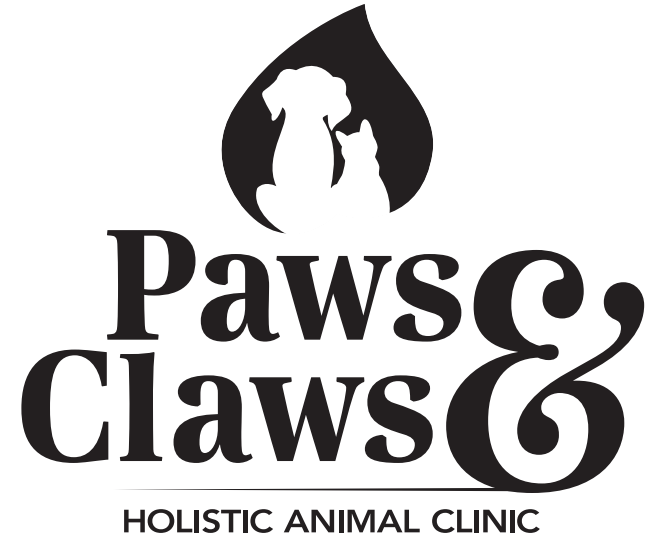
Black and White Logo